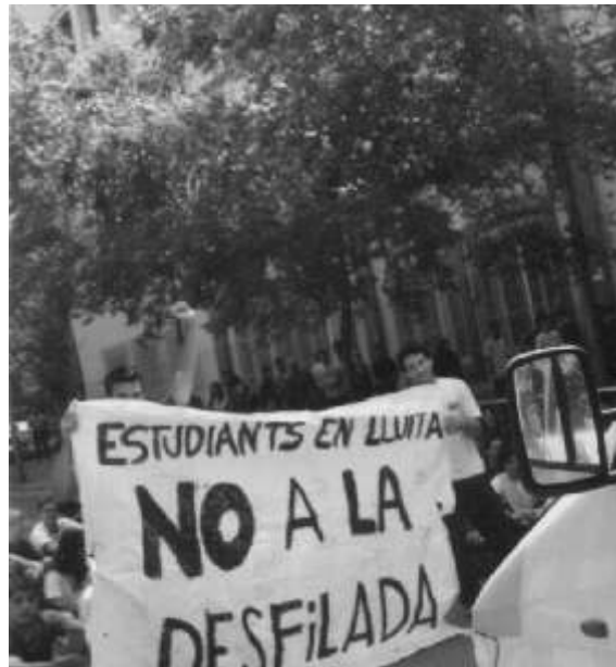
Students on fight. No to the parade

⇒ In Mataró and other towns in the area of Maresme there were different activities summoned by a co-ordinating committee formed by more than thirty