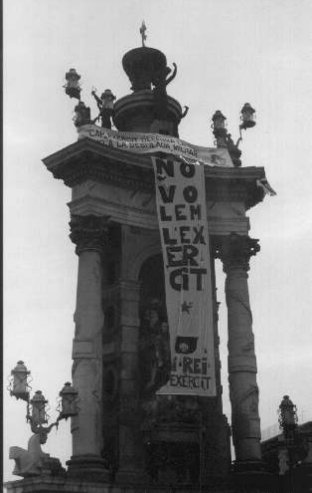
"We don't want the army"