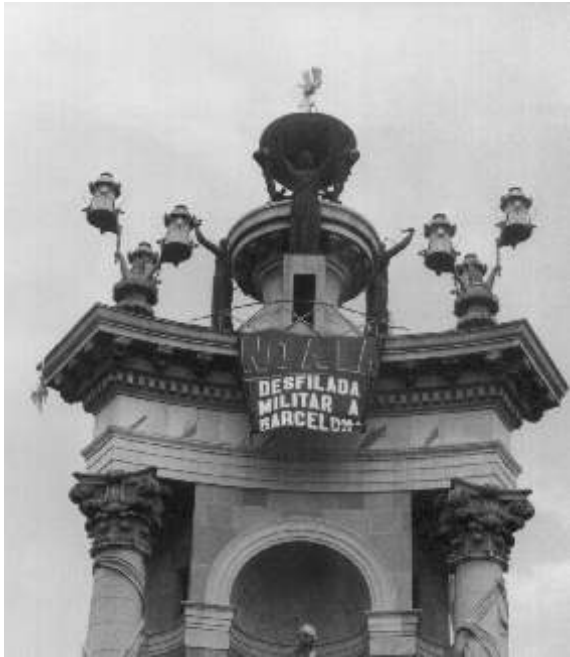
"Stop the military parade in Barcelona"

If we want to guarantee peace and human rights, what we need is to make States and international society strongly supports suppression of inequalities between North and South and promote ecological balance, as well as real democracy and effective disarmament.