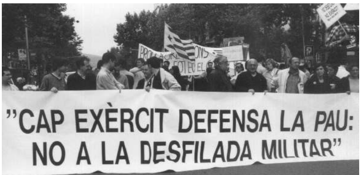
No army defends peace: no to the military parade

The platform included active and dedicated volunteers but also a few sympathetic professionals, in the technical secretariat, communications and the organisation of the Festival. The combination of the assembly system and the flexible co-ordination structure, was effective and efficient, rejected any potential excessive individualisms and allowed all participants to feel themselves reflected in the platform. ■