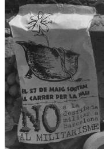
On May 27 out into the streets for peace No to the military parade in Barcelona No to militarism

At the moment, the Spanish army is a part of several offensive military structures, such as the NATO. And, quite often, these structures cover up with humanitarian interventions actions that actually represent their own interests. It is not to be forgotten the role taken by the Spanish Government along the current century. And the anachronism that represents the Army to be, according to the Spanish Constitution, guarantor of the unity of Spain.